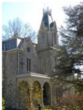
Ebenezer Maxwell Mansion Philadelphia's only authentically-restored Victorian House Museum